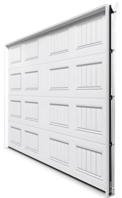
R=16 GAREX Illustrated door: 1 3/4" (R-16)